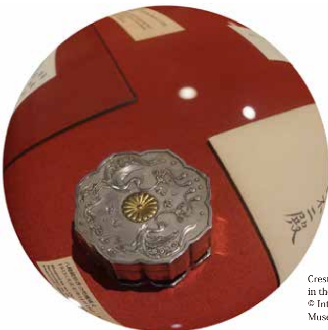
Crested bombonieres bestowed by the Imperial Family, in the Intermediatheque permanent exhibition © Intermediatheque Museography © UMUT works 2013

The present exhibition showcases diverse craftworks related to the Imperial Family, which are particularly important when retracing the history of Modern Japan. The new exhibits include items such as elegant bombonieres elaborately crafted in pure silver, and offered to a restricted number of guests on the occasion of Imperial banquets, as well as large-sized collotype photographs of the current Akasaka Palace, a national treasure, upon its completion. These photographs were taken by Kazumasa Ogawa, who was the first photographer to be named a court artist. The present exhibition is thus a unique opportunity to experience the stylishness of imperial crafts as seen in the University of Tokyo collection.