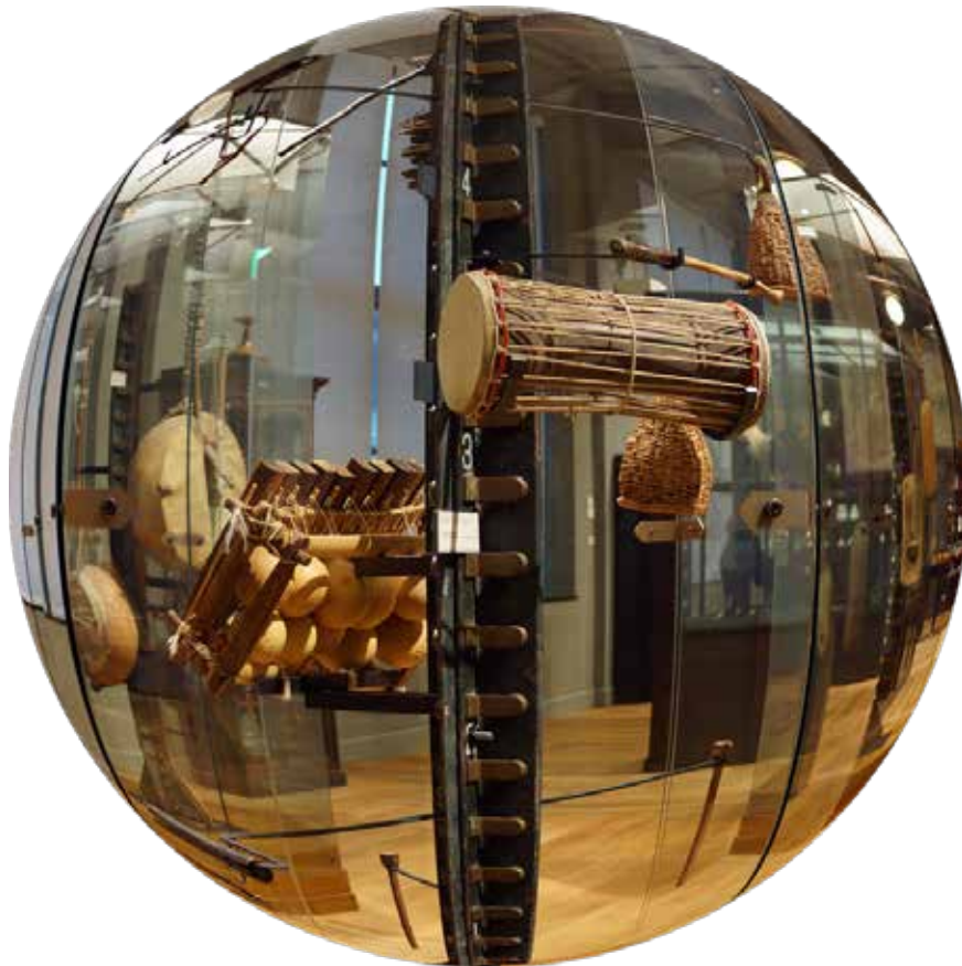
West African musical instruments in the IntermediaTheque permanent exhibition © IntermediaTheque Museography © UMUT works 2013

In this exhibition, we introduce traditional West African musical instruments such as kora , ngoni (strings) and bala (xylophone), which were only passed on by jeli (hereditary artists who perform in the oral tradition). As these are rarely seen in Japan, it is a unique opportunity to introduce the beauty of form characteristic of West African musical instruments.