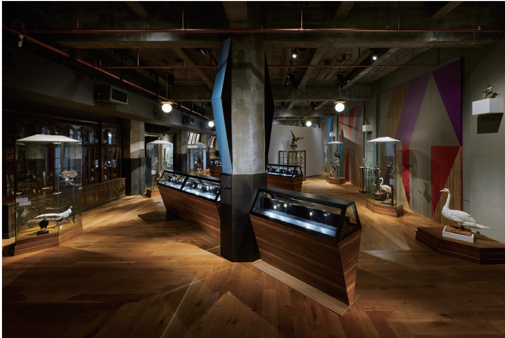
Intermediatheque 10th Anniversary Special Exhibition “Birds in Paradise” Exhibition View

The Intermediatheque 10th Anniversary Special Exhibition “Birds in Paradise” opens to the public today.